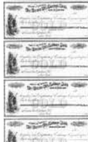
Lot #962 Partial

961. Ormsby. Carson City. Carson City Savings Bank Duplicate of Exchange Sheets. Lot of 2 pcs. "GOLD" imprinted in center. Unused sheets, No.'s 976-985. To the Bank of Montreal, Canada. Gray print, printed by Krebs. Xf, some water damage. Est. $50-75