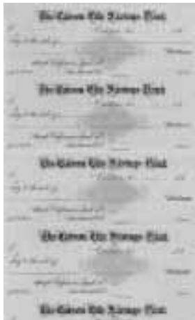
Partial Lot #958

956. Ormsby. Carson City. Carson City Newspaper Invoice Archive. Wonderful archive of 63 bill-heads from six different Carson City newspapers , dated 1877-1905. Nevada Tribune 1877-1882. 8 pcs, 4 different formats. Carson Weekly , 1900-3, 2 pieces, 2 formats. Daily Nevada Evening Tribune , 12 pcs, 3 different formats 1889-1894. The News , 19pcs, 5 different formats, 1897-1903. Morning News , 1 pc, 1895. Morning Appeal , 21 pcs, 1878-1904, 7 different formats. These papers were often the voices of the political factions of Nevada speaking from the Capitol. The invoices are generally for subscriptions from various CC banks. Est. $200-300