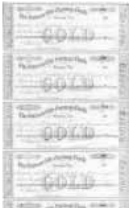
Partial Lot #961

960. Ormsby. Carson City. Carson City Savings Bank Check Sheets. Lot of 2 pcs. Ornate, unused sheets, no.'s 16865-16874. To the Anglo Californian Bank Ld. Vignette at left of Bank building front and street scene. Printed by Krebs. Gilt print, very handsome, Xf. Est. $50-75