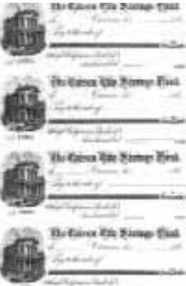
Partial Lot #960

958. Ormsby. Carson City. Carson City Savings Bank Check Sheet. Previously unknown checks, with RNG imprinted rev. 5 connected checks, No.'s 11880-11884. Unused, Xf. Est. $75-150