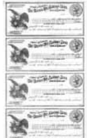
Lot #957 Partial

959. Ormsby. Carson City. Carson City Savings Bank Check Sheets. Lot of 2 pcs. Unused check sheets, with No.'s 649-656. To Agency of Nev. Bank. Virginia. Nev. Vignette at left of spread-winged bald eagle. Black print, printed by Krebs Litho Co. Xf. Est. $25-75