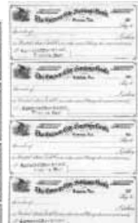
Lot #959 Partial

962. Ormsby. Carson City. Carson City Savings Bank Duplicate of Exchange Sheets. Lot of 2 pcs. "GOLD" imprinted in center. Unused sheets, No.'s 469-472 and 485-488. To Messrs. Geo. Opdyke & Co., NY. Vignette at left of Native American Warrior figure. Black print, printed by Krebs. Xf. Est. $50-75