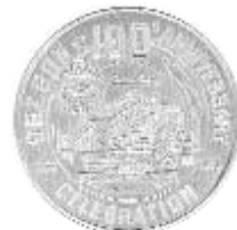
Lots 1155 & 1156 Similar

1155. HK 561. Oregon. Oregon 100th Celebration. 1959 Oregon 100 Anniversary/(Oregon State Seal)/1859 1959/Celebration//State Capitol/(image of building)/1859 1959/Salem, Oregon. Rd, silver, 34mm. Bu-Unc. Est. $20-40