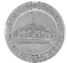
Lots 1134 &amp; 1135 Similar

1134. HK 406. California. San Francisco. San Francisco. Louisiana Exposition Fund, 1915. Panama Pacific International Exposition/(image of building)/Louisiana Building/San Francisco 1915//For Louisiana Exposition Fund/(image of building)/Union Justice Confidence. Rd, bronze, 39mm. Rim nick. Oxidized. Unc. Est. $25-50