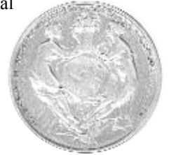
lots 1129 &amp; 1130 Similar

1129. HK 399. California. San Francisco. San Francisco. Pan-American Expo, 1915. Panama Pacific International Exposition San Francisco California MCMXV/(image of two allegorical woman around a globe with cornucopias)//To Commemorate The Opening Of The Panama Canal MCMXV/(image of allegorical man)/On! Sail On!. Rd, silver, 38mm. Xf. Very scarce. Est. $50-100