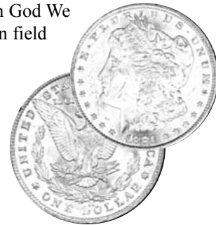
Obverse & Reverse

116. 1882-CC. MS 65 UDM. In ANACS holder. Very deeply mirrored surface, with spectacular eye appeal. Only minor bag marks keep it from being a higher grade. Mintage: 1,133,000 (Yeoman). Est. $500-1000