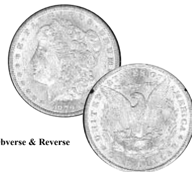
Obverse &amp; Reverse

114. 1879-CC. MS 64. In the original Government plastic case and box. Obverse: Very strong strike and features. Frosty and lustrous with a good mirrored surface. Bag marks on cheeks, neck, and eye. Fields are relatively clean. There is a distinctive "die line" under the nose. Reverse: Bold strike, frost with mirrored fields, but poor detail of the bird's chest feathers, as originally struck. The reverse is the perfect CC variety. Mintage: 756,000 (Yeoman). Est. $3000-6000