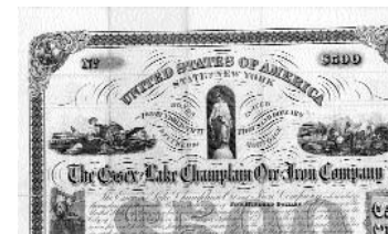
This image is not trimmed tight at right as shown. Only partial image.

2260. Essex. Lake Champlain. Essex & Lake Champlain Ore & Iron Co. Incorporated in New York. $500 Bond, no cert #, unissued, unsigned. Several vignettes. To right of several miners working on surface with picks and shovels; at center of an allegorical woman statue; at upper left of a rendition of the New York State Seal; at left of a cross sectional view of a mine shaft showing below and above surface activity. Small vignettes at the top corners of miners. Black border with bold red underprint. All coupons attached with bold red underprint. Printer - J. Haehnlen, Philadelphia. 13 x 16. This company was most likely mining the high grade Bessemer iron ores found within Essex County within the Lake Champlain district. The county sits along the western side of Lake Champlain proper. The area is given an extensive write-up by Pempelley (1886, p.105-136). Foxing along center fold. One inch tear along right fold crease from top edge just entering border. Very fine. Est. $150-300