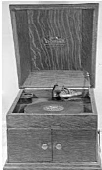
Lot 2667 and 2669