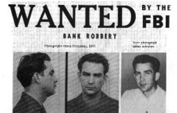
Lots 1859 & 1860 are similar

1859. Wanted Posters. Eleven pictorial full sized FBI wanted posters for bank robbers 1952-1956. 11 x 17" with three photos of suspect, names, aliases, description, criminal record, and cautionary notes. These were all mailed to the Hotel Beverly in Freeport, Ill. J. Edgar Hoover seems to have started this massive public plan to find criminals by distributing posters. These posters all carry a "Wanted Flyer" number on the bottom left corner, and all have numbers between 86 and 188, very low numbers, indicating these may be from the beginning of Hoover's program. Great décor for a restaurant or for any western collection. Est $100-200