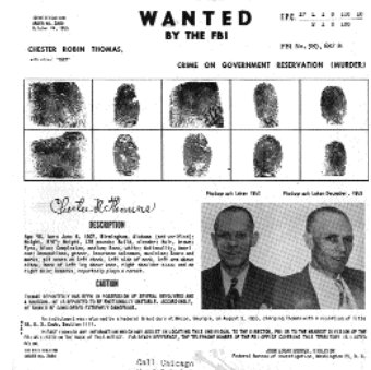
Lots 1861 & 1862 are similar

1861. Wanted Posters. Lot of 66 card FBI Wanted posters , 25 are pictorial, carrying the suspects fingerprints, signature and photographs. 8 x 8" each. These cards were mailed to post offices, major hotels, and other public places. Printed signature on bottom of J. Edgar Hoover. These all date from 1956-62, mailed to the Hotel Beverly in Freeport Illinois. They range from everything from bank robbery and murder to car theft. 41 of the cards are apprehension orders notifying the public that certain criminals had been caught or were discharged. All vf-xf. Est. $120-180