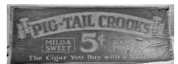
Lot 2754 and 2753, respectively

2760. Tobacco. Pig-Tail Crooks Cigar advertisement piece . Ad is mounted on poster board, or material of similar gauge. Yellow banner and yellow print on red background. Est. $50-150