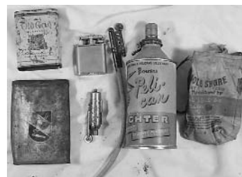
Lot 2771 and 2769

2771. Tobacco. Rieiss Folding Pocket Pipe in original box. c. 1915-25. Est. $50-100