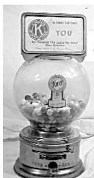
Lot 2361 and 2362, respectively

2361. Coin-Op. Table Top Tube Coin Dispensers, c.1920-40. Lot of 2 pcs. These were used anywhere people needed change, gambling establishments in particular. 12"x12"x5". Fine. Est. $200-400