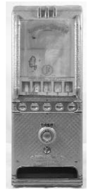
Lot 2376 and 2375, respectively