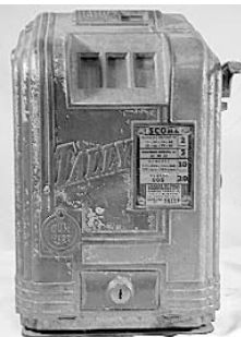
Lot 2373 and 2374, respectively.

2373. Coin-Op. Jennings Export Chief 25 cent Slot Machine. Three reel style machine with right hand side lever. Original, working, wood base. 28"x15"x15". Extremely fine. Est. $1000-2500