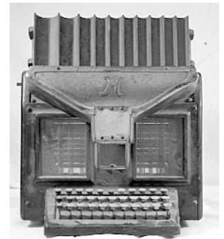
Lot 2372 and 2371, respectively

2372. Coin-Op. Tokette Gum Trade Stimulator. Three reel, one cent trade stimulator. Green with a lever on the right side. Back missing without the original handle. 10"x10"x8". Fine. Est. $300-600