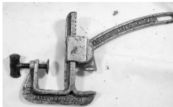
Lot 2601 and 2600, respectively.

2600. Kitchen. Primitive Tabletop Nut Cracker by Kelling-Kerl of Chicago, 1913. Est. $50-100