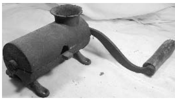
Lot 2591 and 2590, respectively.

2590. Kitchen. Primitive Tabletop Meat Grinder, c. 1880. Rusted and chipped. Est. $25-75