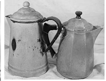
Lot 2491 and 2492

2492. Coffee. Two Small Stove Top Coffee Pots . One white enamel the other one is aluminum, c.1890-1900. Est. $50-100