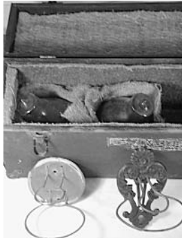
Partial, Lot 2500