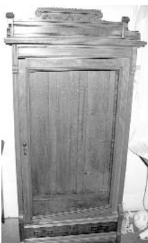
Lot 2516 and 2515, respectively

2514. Furniture. Children's Roll-top desk. Great Piece! Approximately 3' x 2' x 1'. Made of oak. Fine to Very Fine. Est. $200-400