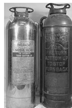
Lot 2507, 2508 and 2509

2509. Fire. Two Brass Fire Nozzles. About 12 inches long for each. One for 4 inch hose, the other for a 2 inch hose. Est. $75-150